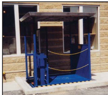
Telescoping Lift * variance required

Each VRC is manufactured as a single or double mast unit with your choice of frame and drive as listed below. A variety of options and accessories are available to customize your lift to meet your needs.