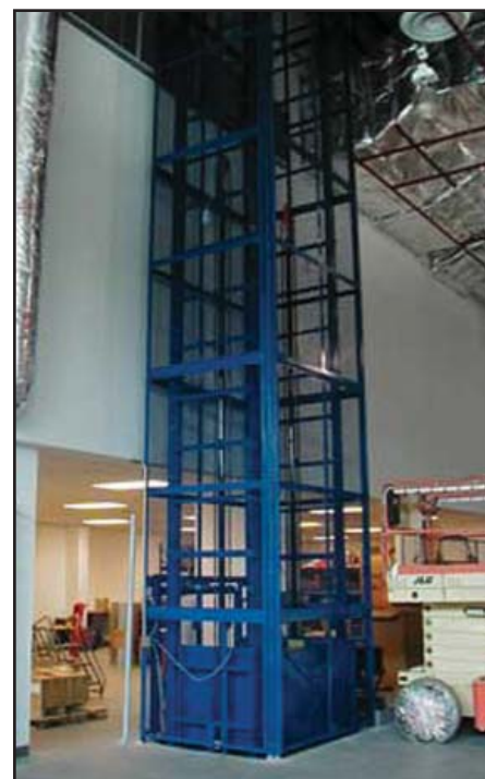
2-Level Lift with enclosure

Vertical Reciprocating Conveyor (VRC) is designed to comply with ANSI B 20.1