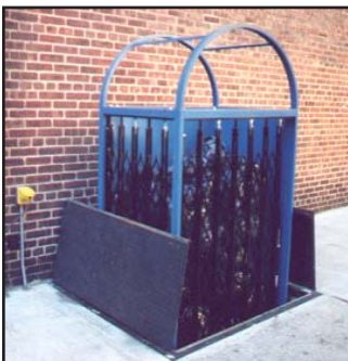
Sidewalk Lift - 90 degree * variance required

C = enter/exit, Z = straight through, L = 90 degree