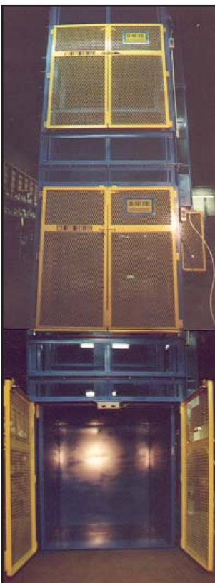
3-Level Lift with enclosure

requires minimal space with no extensive supplementary construction. In addition to our standard models, each VRC can be custom designed to suit a variety of applications including sidewalk lifts, vehicle lifts, casket lifts, or any unique application you have.